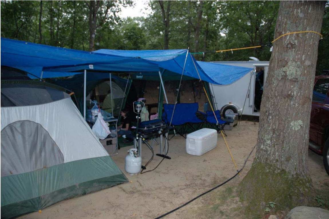
Figure 2. Typical camp site set-up.

Figure 2 is a picture of our camp site from a 2005 camping trip and figure 3 is a close up of the cooking tabl.