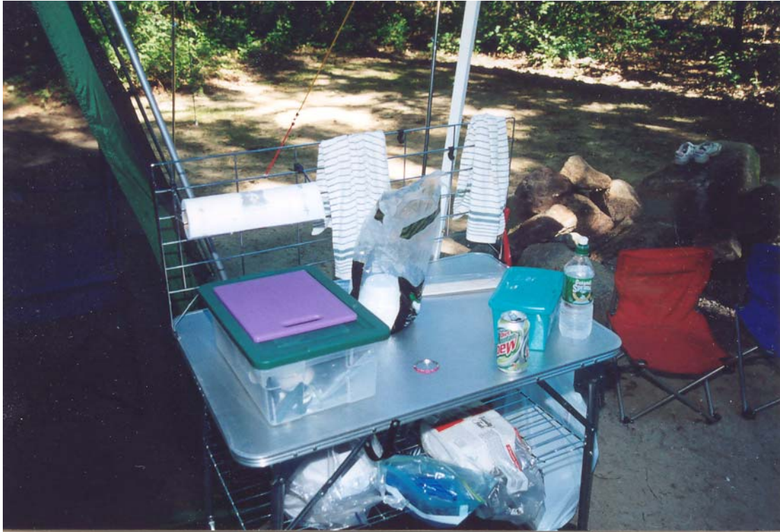
Figure 3. Cooking table.